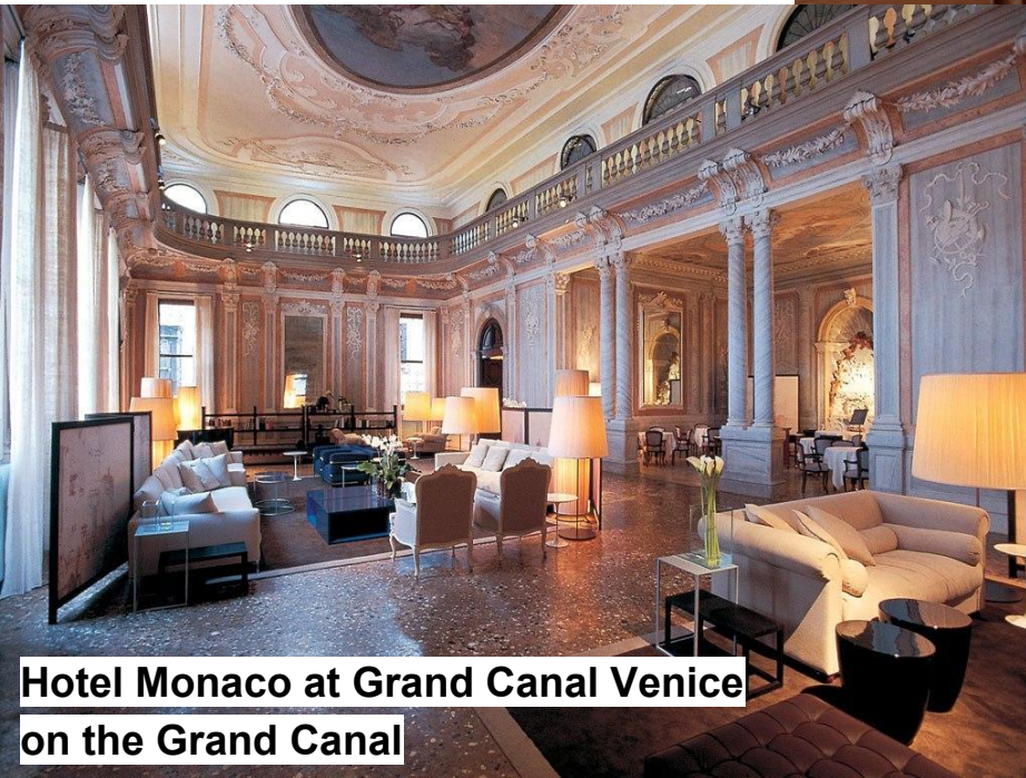
Hotel Monaco at Grand Canal Venice on the Grand Canal