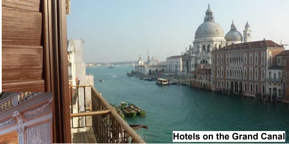
Hotels on the Grand Canal