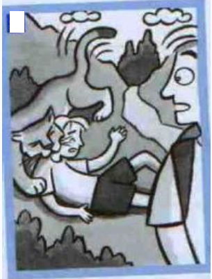
got the shock of one's life