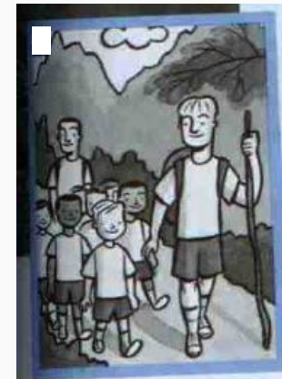
set out on