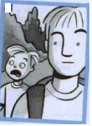
in front of