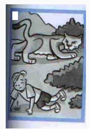
let go of, back off