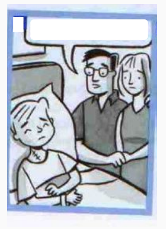
a close call