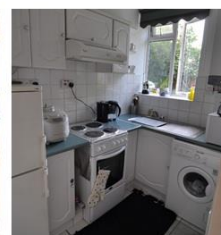
In Southbank opposite riverside from Palace of Westminster