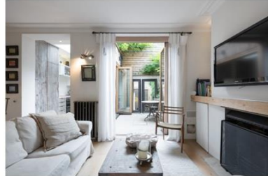
In Bermondsey near from Tower Bridge