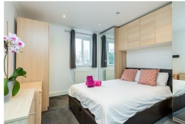
In Knightsbridge Near from Museums and Harrods