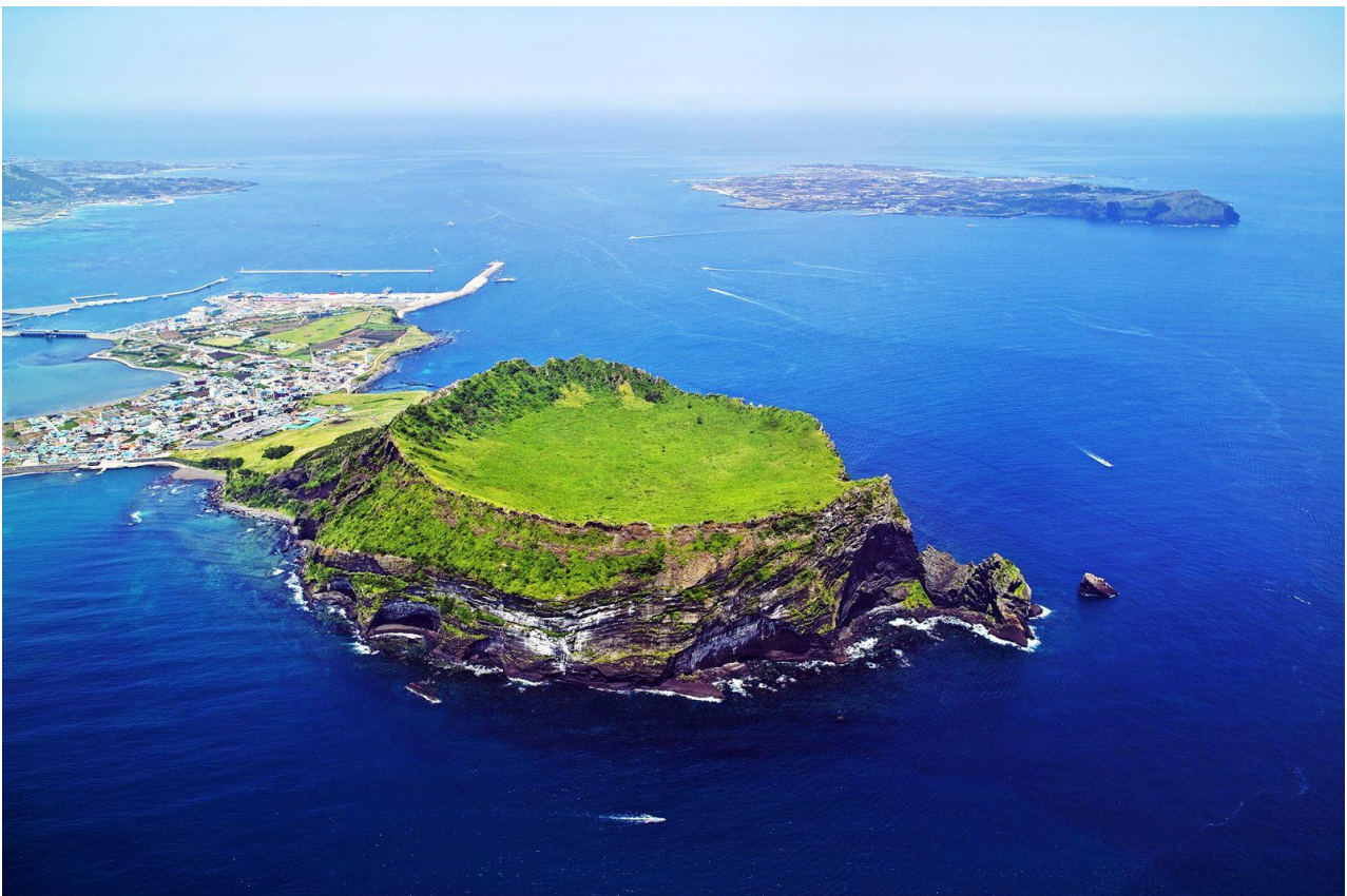
Picture of Jeju Island