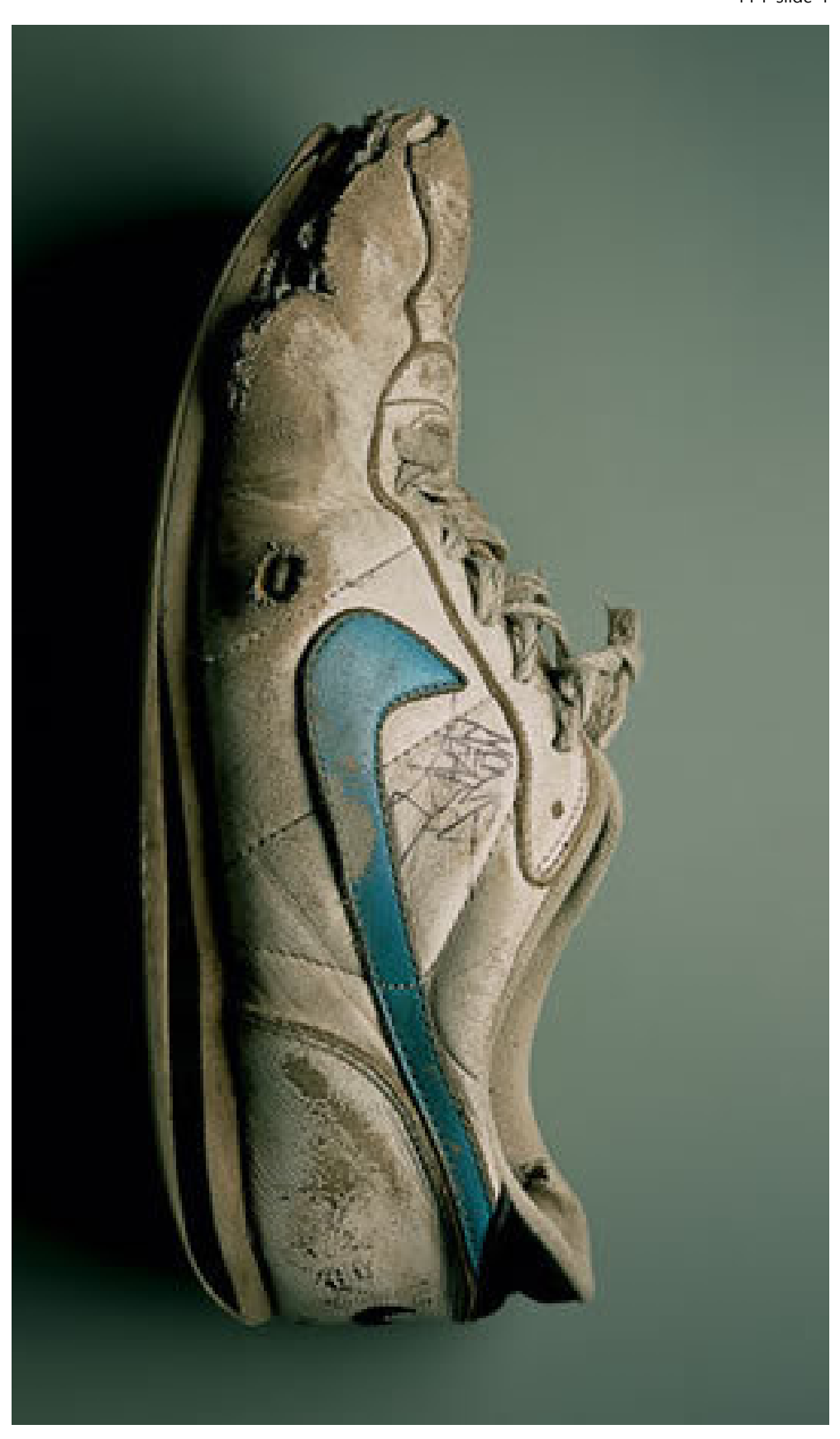
Page 14 of 17