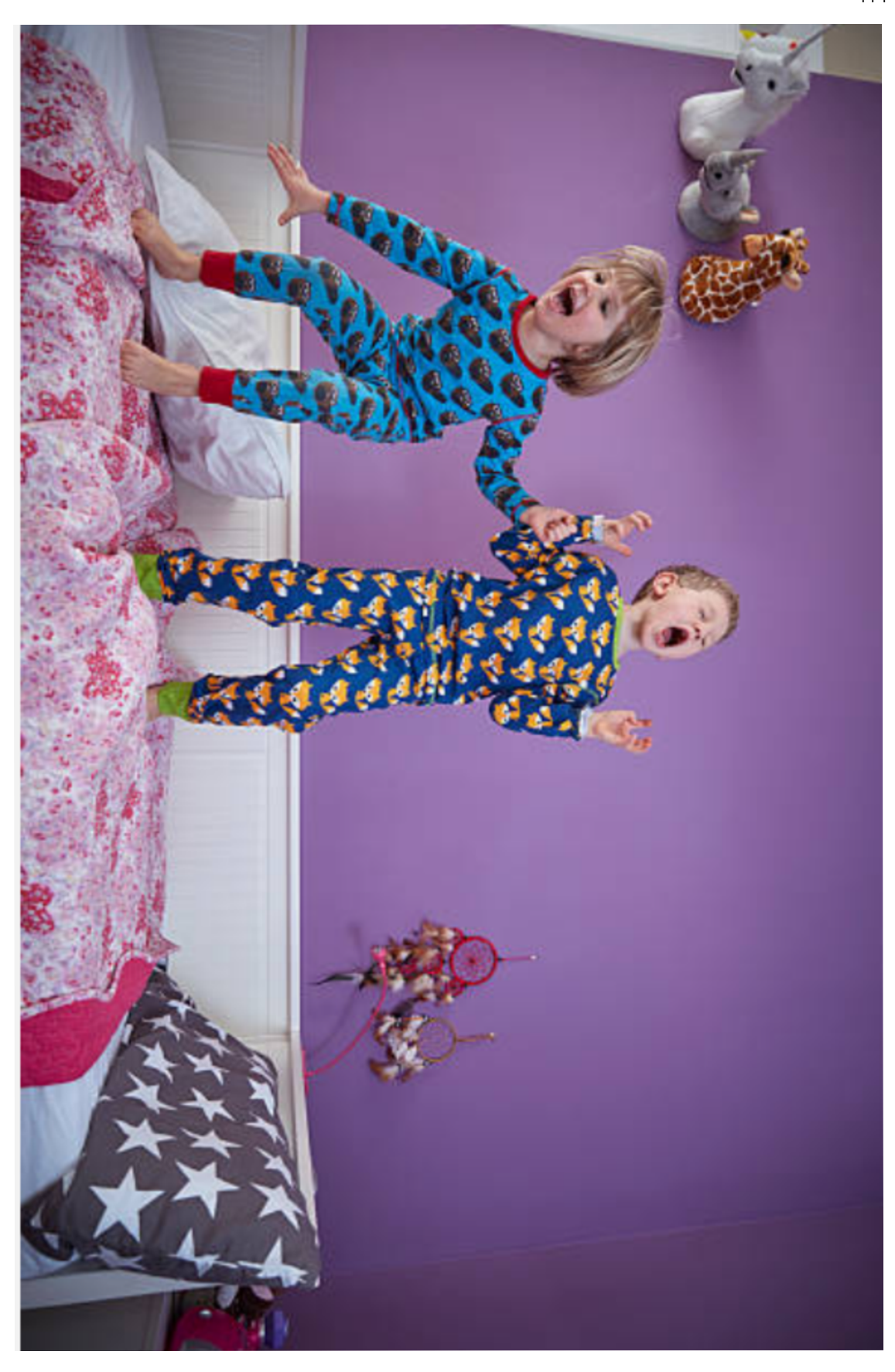
Page 13 of 17