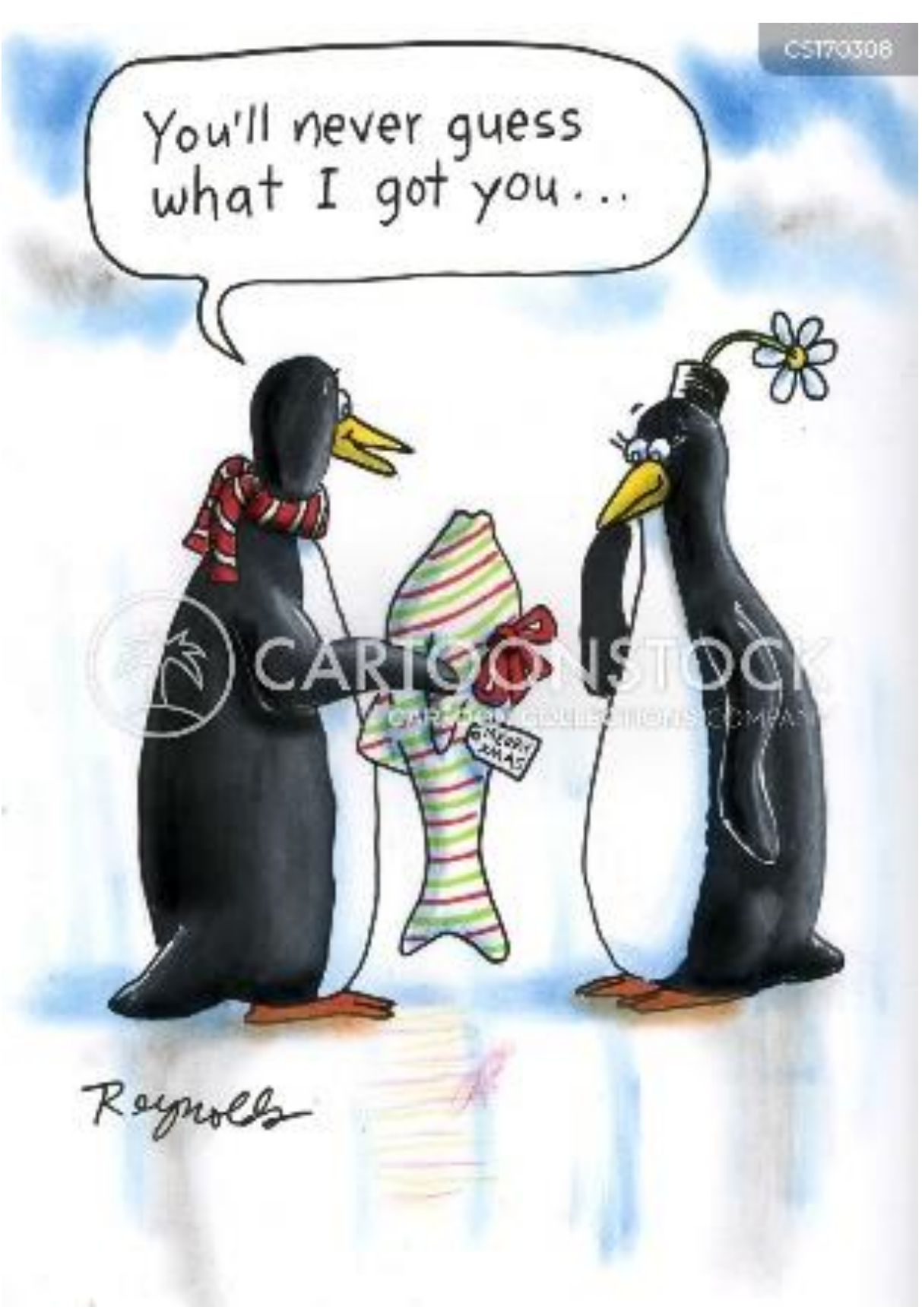
Page 9 of 11